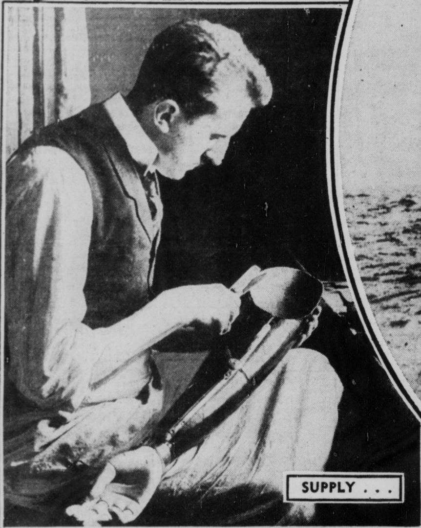
SUPPLY . . .