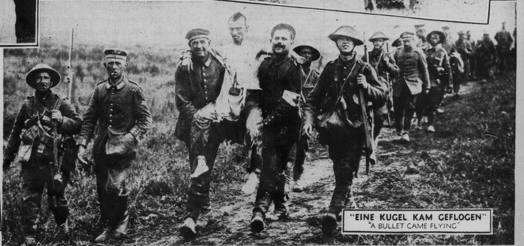
"EINE KUGEL KAM GEFLOGEN" "A BULLET CAME FLYING"

THIS IS THE TWELFTH PAGE OF AUTHENTIC WORLD WAR PICTURES BEING REPUBLISHED IN THE INDIANAPOLIS TIMES DAILY. THEY ARE FROM LAURENCE STALLINGS' FAMOUS COLLECTION, "THE FIRST WORLD WAR."