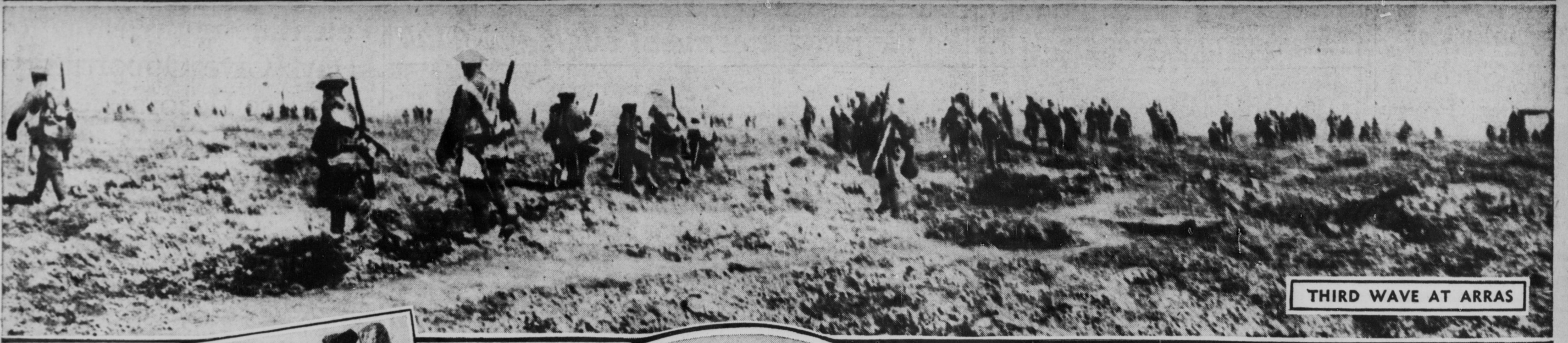
THIRD WAVE AT ARRAS