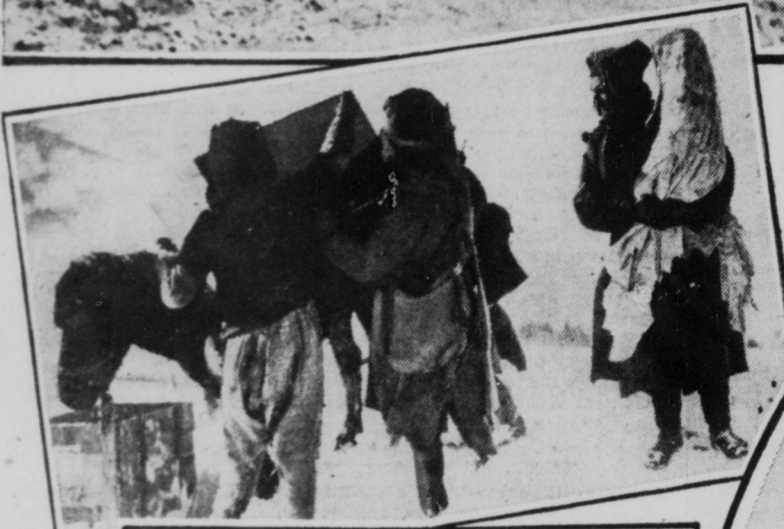
BACKWASH: SERBIA TO ALBANIA