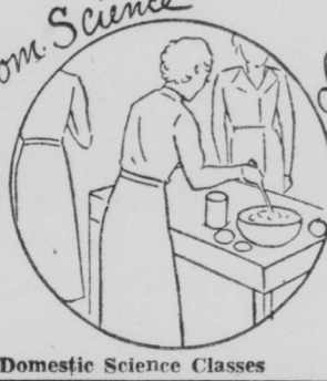
Domestic Science Classes