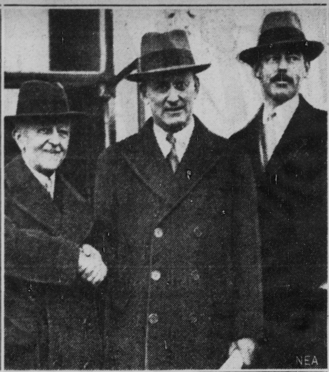
A monumental task changes hands here, as outgoing and incoming United States treasury heads meet. Secretary W. H. Woodin, left, taking a leave of absence, gives a good luck shake to Henry Morgenthau Jr., center, former farm credit chief, now acting secretary of the treasury, as Dean Acheson, retiring acting secretary, stands at the right.

Fleet Commander and His Officers Inject New Life Into Staff at British House.