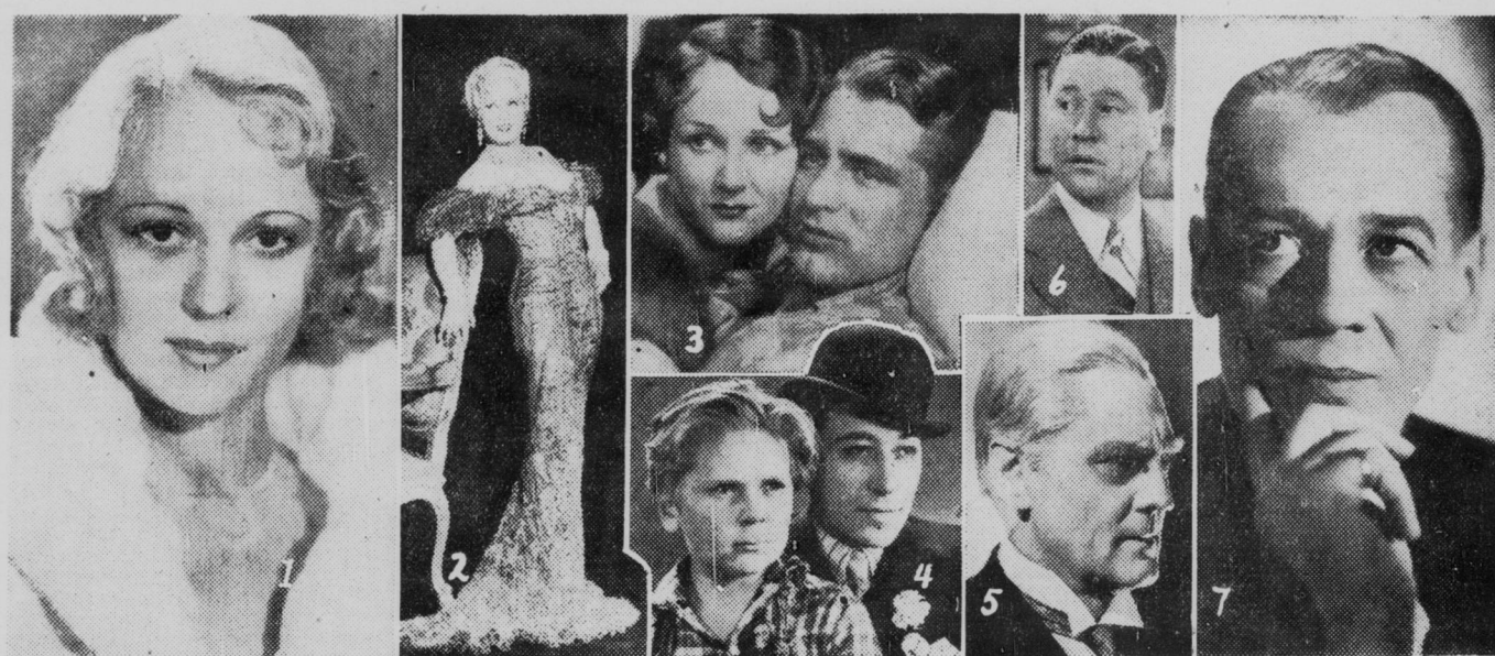
1—Sally Eilers has one of the leading roles in "Walls of Gold," now on the Apollo screen. 2—Here is Mae West all dressed for company, human male, not lions, in "I'm No Angel," now at the Circle. 3—Gary Grant in a comfortable scene from "Gambling Ship," which opens a four-day engagement at the Ambassador, Sunday. 4—Here is a cute picture of Jackie Cooper and George Raft in "The