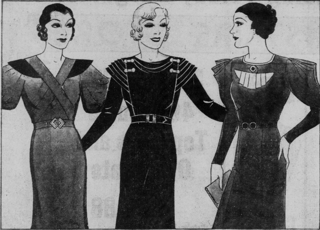
Fashion's in the "Red." A red silk crepe dress with black velvet trim on collar, puff sleeves and an interesting criss-cross neckline . . . $6.95 or 2 for $12.