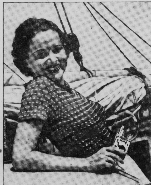
●ABOVE—"TLL NEVER BE a racing champion, but I love the water. And when I'm out on a boat I have a keen zest for smoking and do smoke a lot. To avoid getting my nerves upset and fidgety I changed my brand, and now smoke Camels. Camels don't interfere with healthy nerves, and they keep right on tasting good even when I go in for smoking in a big way."