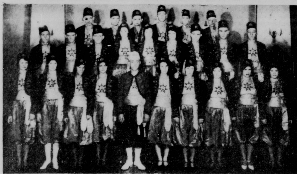
Drill Team of Arris Court No. 5, Ben-Hur Life Association

National honors will be sought by the local court of the Ben-Hur Life Association when it will take part in the National Fraternal day drill contest to be held Friday in the Hall of Science at A Century of Progress.