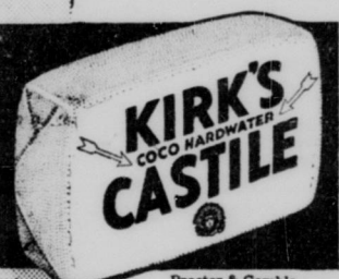
Procter & Gamble

OCEANS OF LATHER—EVEN IN HARD, COLD WATER