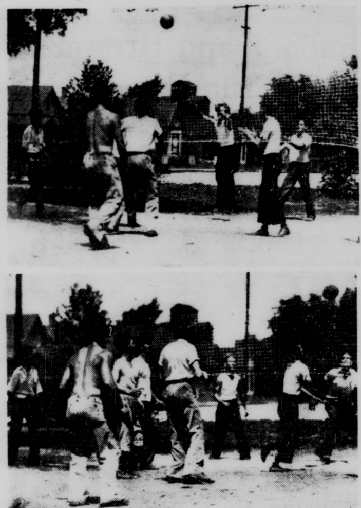
Upper—No. 1 volleyball team of Indianola park closing in on the No. 2 team after having served.

Lower—No. 1 team has batted ball over net to right sideline to gain a point. No. 2 team player is shown attempting to return the ball and save the point.