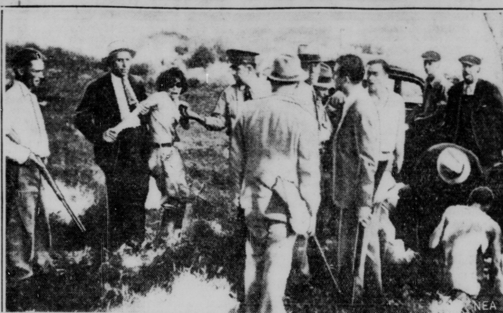
The furious gun battle between the murderous Barrow gang and an Iowa posse just had ended near Dexter, Ia., when this picture was made. Blanche Barrow (left center) struggles hysterically with two officers, her face a mask of terror and hatred. Marvin Barrow, her husband, called "one of the three worst killers in the United States," crouches on the ground at right, six bullets in his body.

Other members of the gang escaped and are being pursued in a hot manhunt which seeks to bring them to justice for a series of robberies and murders from Texas to Iowa.