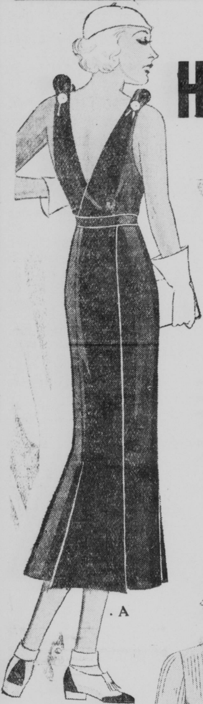
A—A black linen golfing frock with deep sun-tan back; surplice style both front and back. Large buttons at shoulders.

Ayres' Downstairs Store's customers are HONORED GUESTS! When they come to us we do all in our power to TREAT them as honored guests! For instance, we "control the weather" in our big Downstairs Store—to make it just right for greatest comfort! Neither "heat" nor "humidity" is a problem here! In addition our "guests" are never crowded—in spite of tremendous numbers of "guests" who visit us each day. Wide, spacious aisles, is the answer! Why not do ALL your shopping—in the ONLY store which considers YOUR COMFORT!