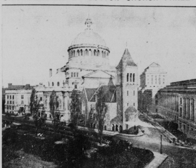
The new Christian Science publishing house.

Nine Indianapolis people attended the annual meeting of the First Church of Christ, Scientist, in Boston, Monday.