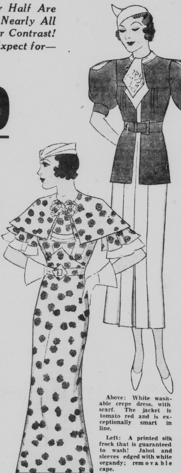
Above: White washable crepe dress, with scarf. The jacket is tomato red and is exceptionally smart in line. Left: A printed silk frock that is guaranteed to wash! Jabot and sleeves edged with white organdy; removable cape.