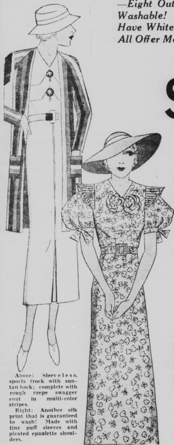
Above: Sleeveless, sports frock with sun-fan back; complete with rough crepe swagger coat in multi-color stripes. Right: Another silk print that is guaranteed to wash! Made with tiny puff sleeves and pleated epaulette shoulders.