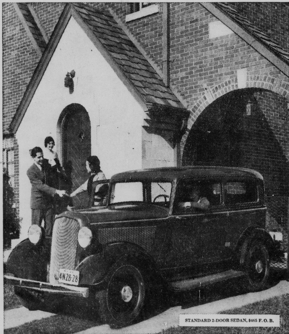
STANDARD 2-DOOR SEDAN, $465 F. O. B.

AMAZING NEW LOW PRICES! . . LONGER . . MORE BEAUTIFUL!