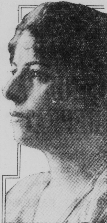
Mrs. Pearl S. Buck