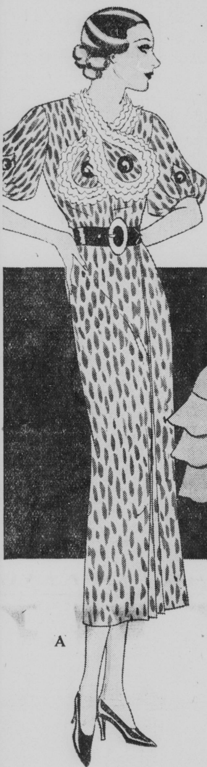
A—Blue and white chalk print with a detachable, lacey jabot; short puff sleeves.

—Long Sleeves —Puff Sleeves —Color Contrasts —Lots of Buttons —Downstairs at Ayres.