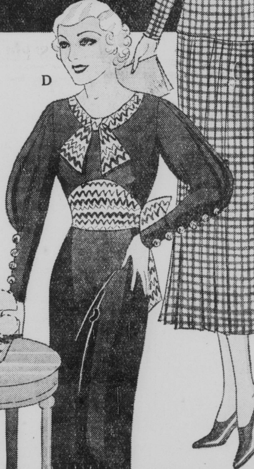
D—A smart looking bo- lero effect is the point of interest in this navy blue crepe frock; "blouse" is printed silk.