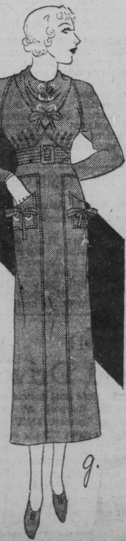
G—Sports frock of bright blue rabbit hair woolen—made with an especially interesting neckline; two pockets.