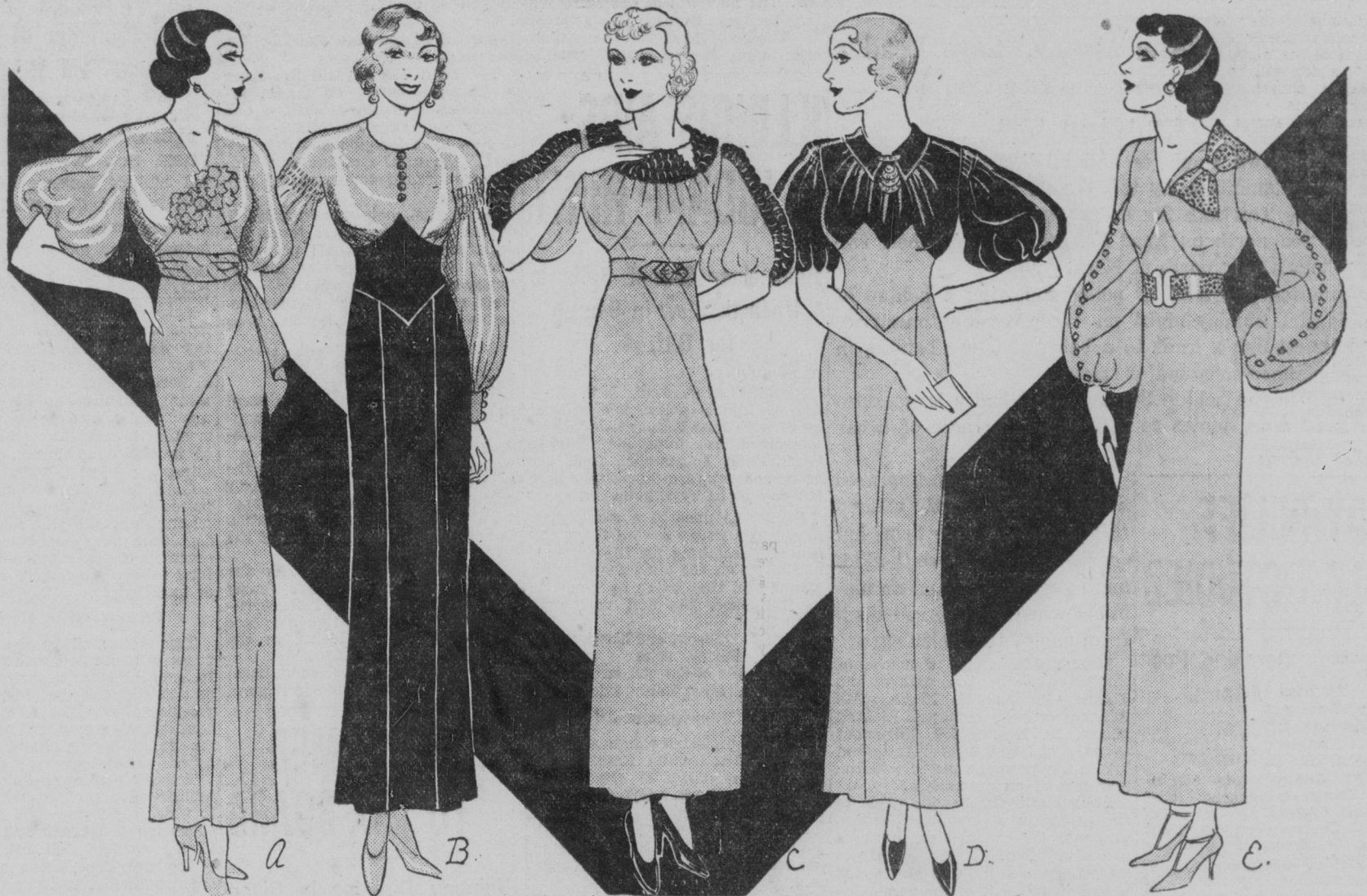
A—A gorgeous Hostess Gown with bodice in velvet and skirt of crinkle crepe. Tangerine red is the color. B—Rich brown Canton skirt is combined with a Tangerine red velvet bodice in this Hostess Frock. C—Another Hostess Gown in gold crinkle crepe with a shirred brown velvet trim forms the trimming. D—Rich, deep Hyacinth blue velvet contrasted beautifully with lighter Hyacinth of the crinkle crepe skirt. E—A metallic belt and bow—and metal button trimmed Victorian sleeves add charm to this Lovely Hostess Frock.

Downstairs at Ayres—A Complete Store on One Floor!