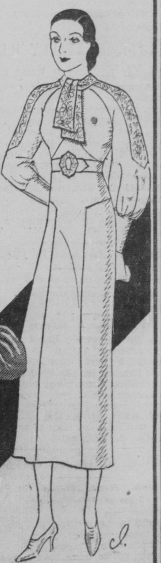
I—Fawn gray crinkle crepe street or business frock of bright blue satin-back crepe. The satin side is used for contrast; note the metal button trim.