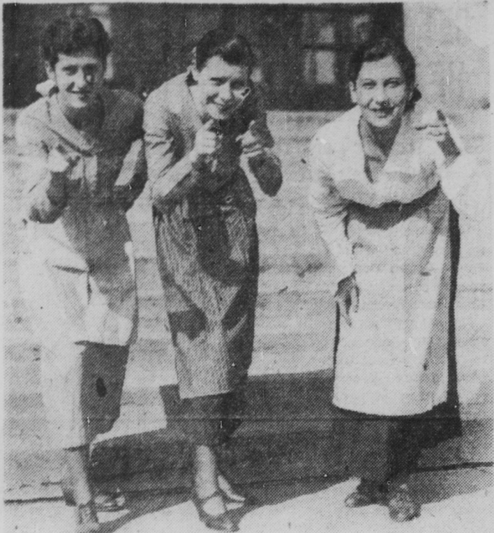
"An' the Gobbie-uns'll git you if you don't watch out!"

That's what the three girls shown above warned Washington high school pupils Thursday.