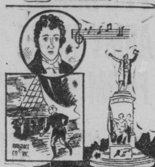
FRANCIS SCOTT KEY 1779-1843

Born at Pipe Creek, Md., in 1779. He will always be dear to the hearts of his countrymen for writing the "Star-Spangled Banner." Detailed aboard a British ship during the War of 1812, he witnessed the heroic defense of Fort Mchenry during the British bombardment, and was inspired to write the immortal anthem of America.