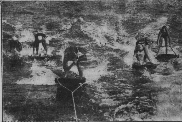
Aquaplaning is a sport full of thrills for participants and spectators. Your car takes you to these interesting places.