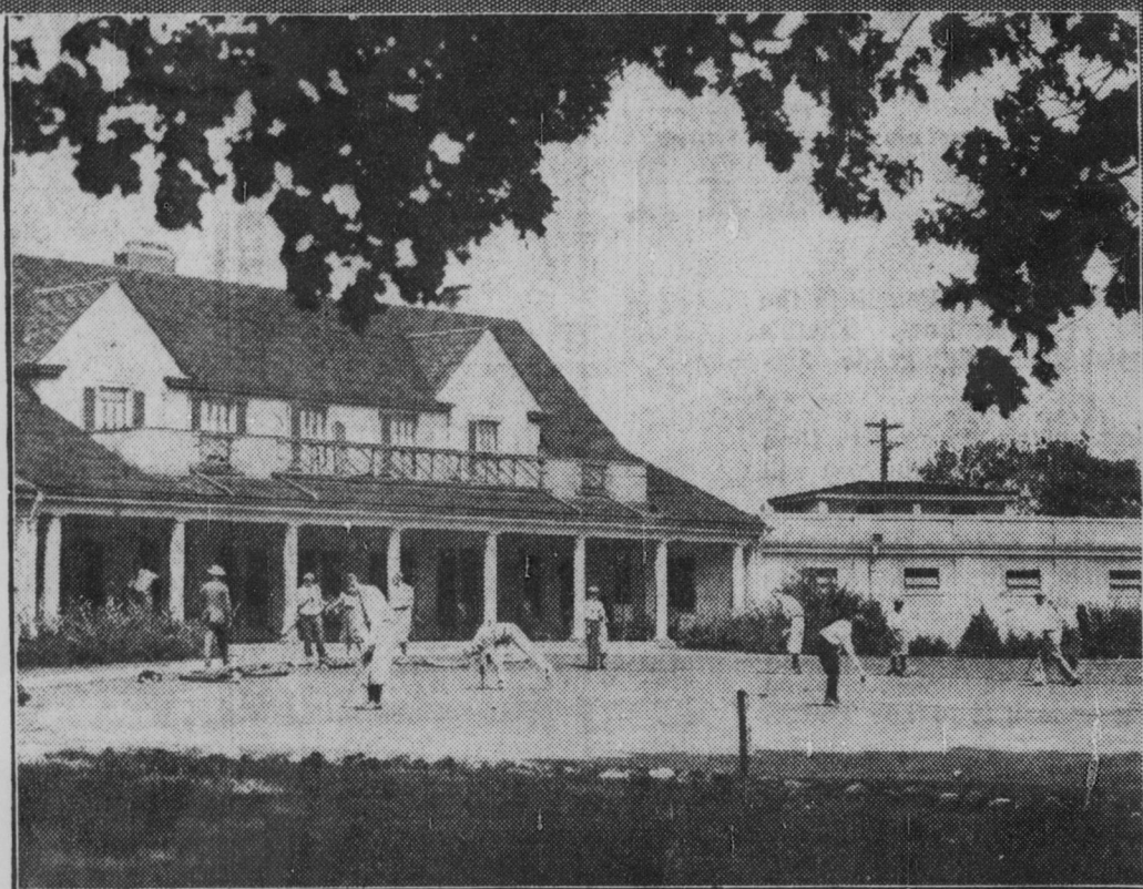
The Middle West has hundreds of attractive Golf Links accessible to motorists seeking outdoor beauty spots in "Places to Go".

Let's be off to interesting places—places that are different! Where are they? In the Middle West, and your car will take you there. You will be interested in owning a copy of "PLACES TO GO", forty-six pages packed with information, which will start you off with enthusiasm both for the trip and its destination!