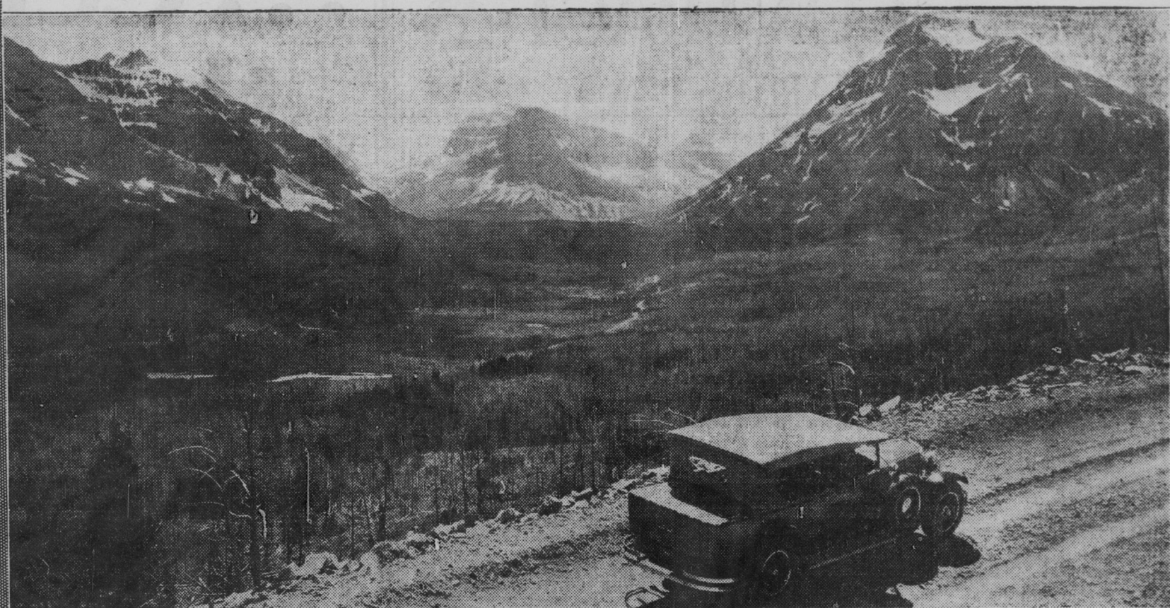
View mountains from the comfortable security of excellent roads. These peaks are the Rockies, and we are now in Glacier National Park, which contains some of the noblest mountain scenery in all America.