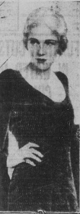
Ann Harding is willing to tear up a contract under which she gets $5,500 a week.