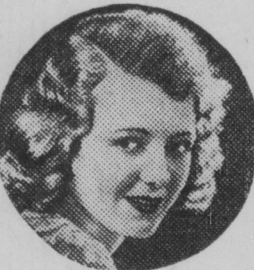
JANET GAYNOR "Ideal Heroine"