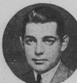
CLARK GABLE "Ideal Hero"

These and many other details of "inside stuff" on the movies will be found in "Unstarred Stars"—in Pictorial Review for May. "Unstarred Stars" is perhaps the most revealing, straight-forward article on the great moving picture world that has ever appeared in the pages of a leading woman's magazine. No movie-goer should miss it!