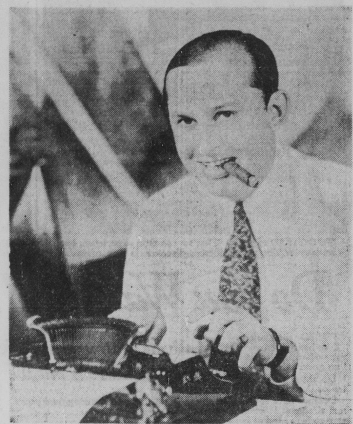
Ben Bernie types 'em off.

Get In This Contest Now, and Take Money Away From Old Maestro.