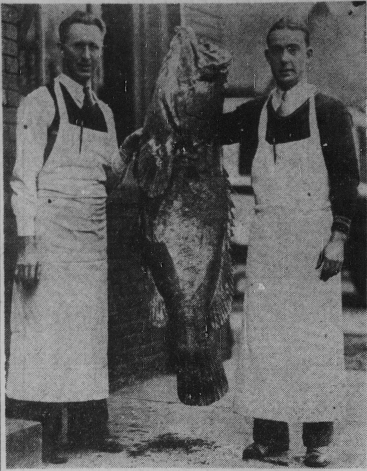
Anglers, take a look at this 150-pound sea bass!

The bass, one of three hooked off of Marco, Fla., is on display at Dady's market, 3431 West Michigan street. They were caught