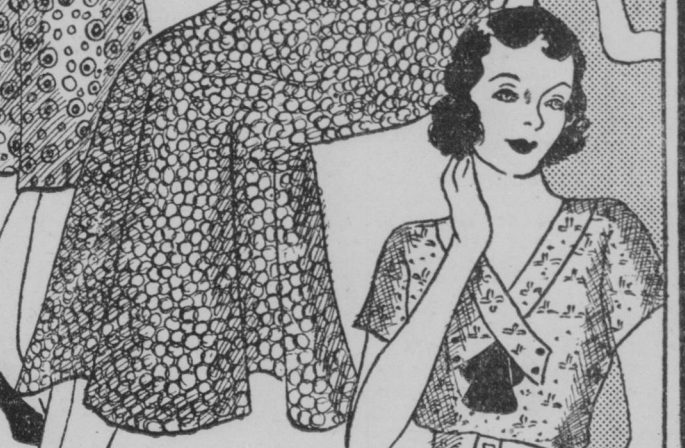
57 LEAFLET DESIGN 36-44