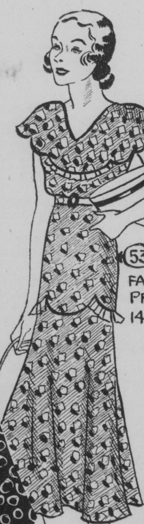
53 FANCY PRINT 14-20