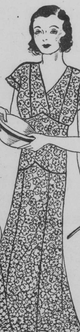
50 FLORAL DESIGN 36-52