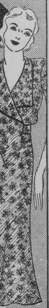
11 FLORAL PRINT 36-44