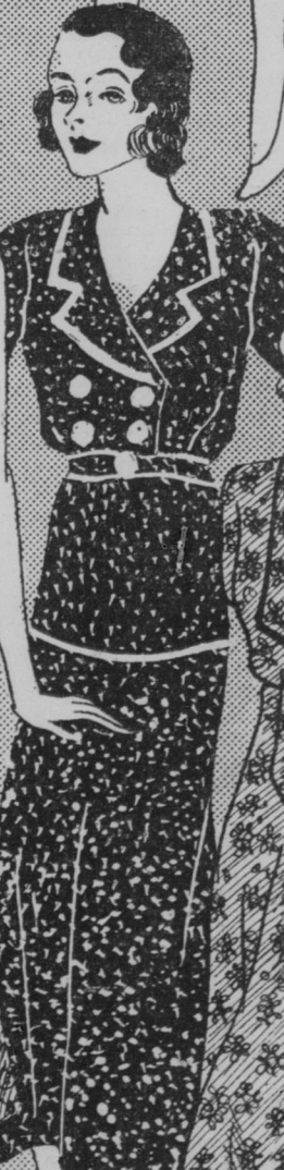
15 DARK PRINT 36-44