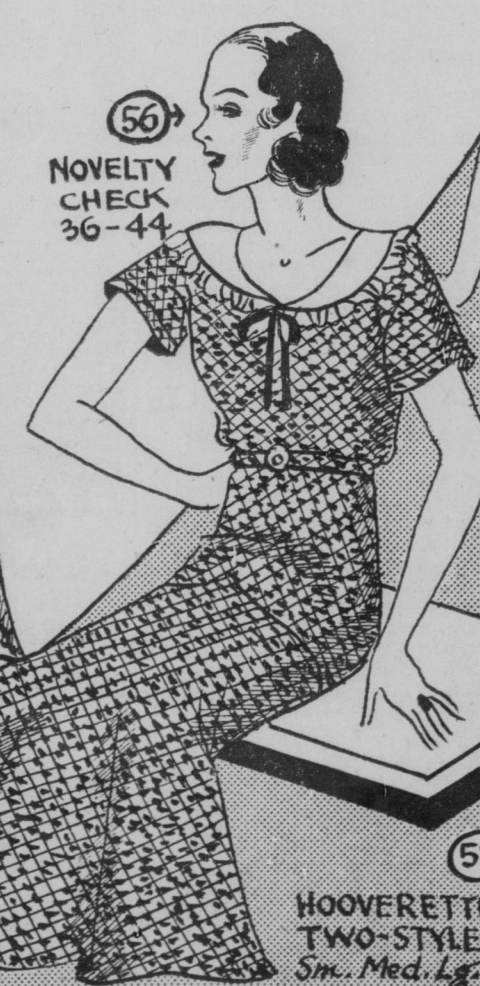
56 NOVELTY CHECK 36-44