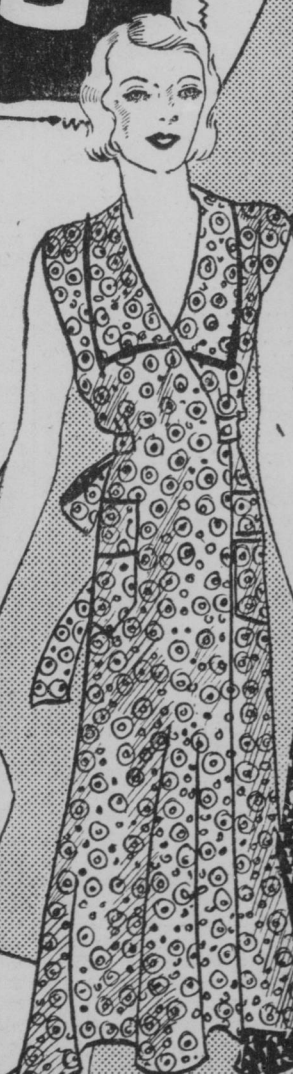
58 HOOVERETTES TWO-STYLES Sm. Med. Lg.