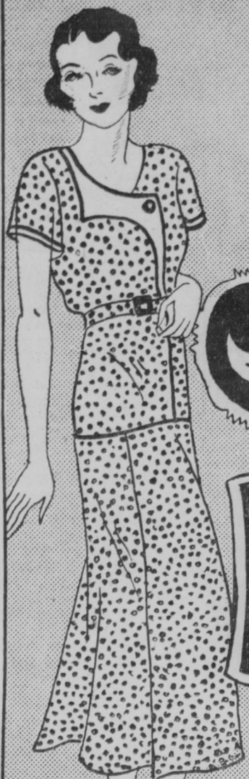
55 DOTTED PRINT 36-44