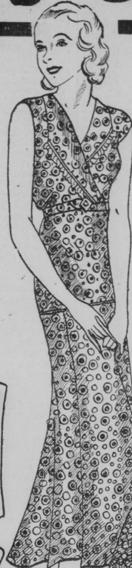
60 RING-DOT PATTERN 36-44