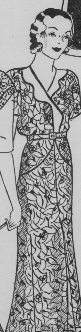
54 FANCY PRINT 36-44