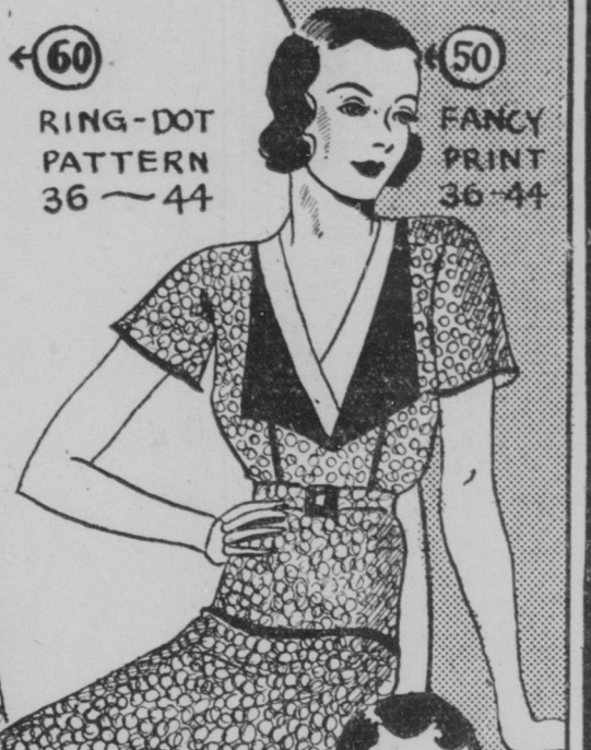
50 FANCY PRINT 36-44