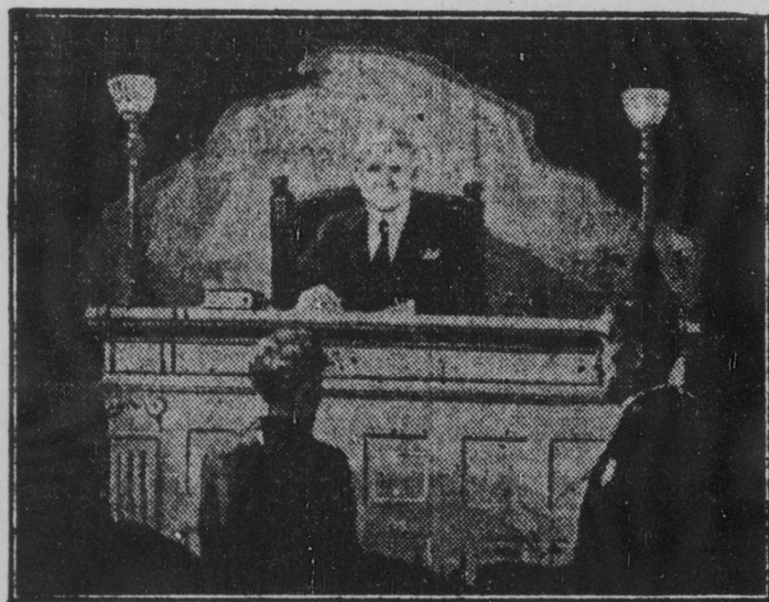
If you are leaving ethical training out of the education of your children, you must accept the responsibility.

This page is made possible by our leading citizens, who are lending their unselfish support to build wholesome characters in the youth of today—for they are citizens of tomorrow.