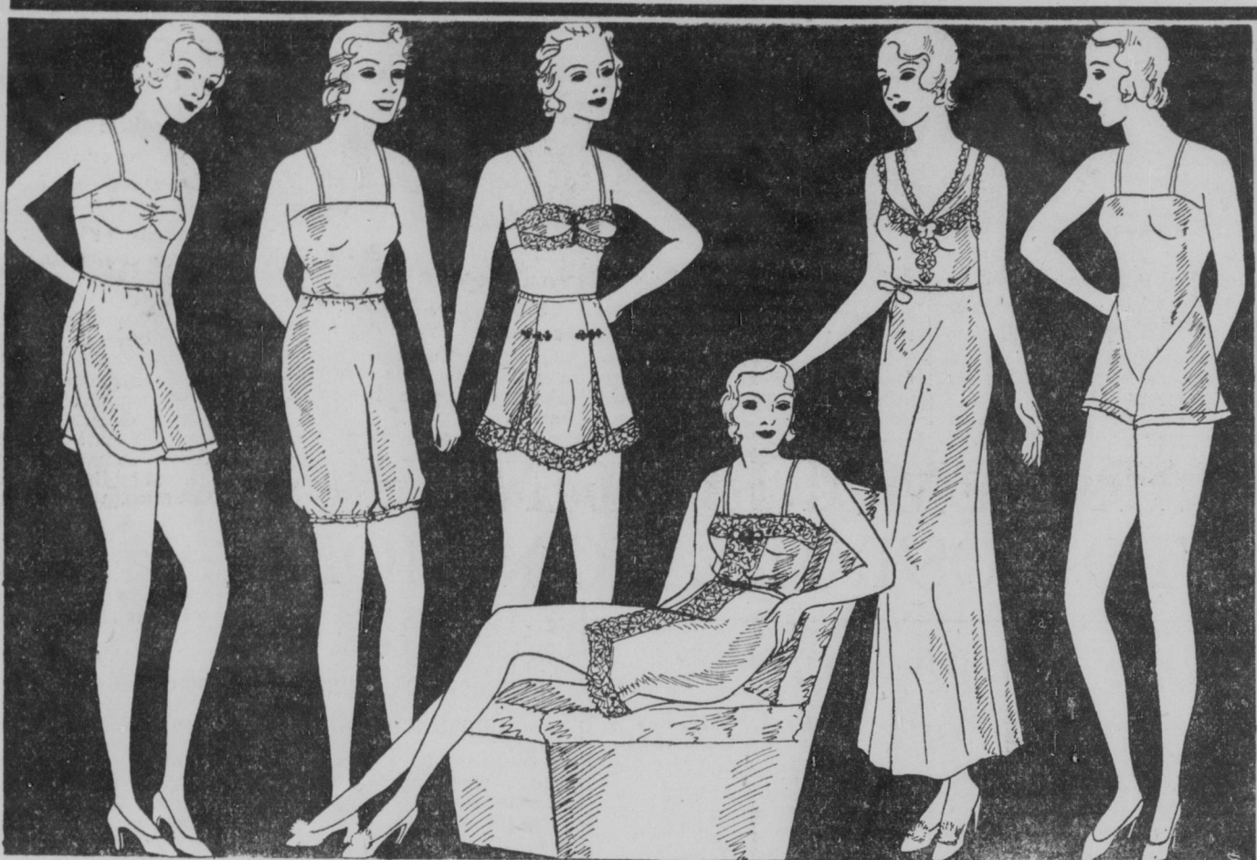
Rayon Stepins 39c. Bloomers and Vest, 39c each. Pure Silk Dance Set, $1.39. Pure Silk Chemise, $1.39. Rayon Gown, 50c. Rayon Chemise, 50c.