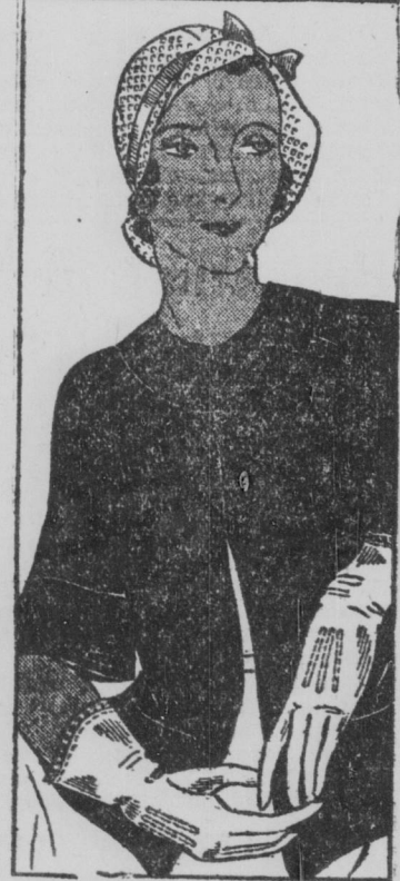
Pique jacket, pique gloves and hat

up with a pique hat . . . because pique hats are fashionable, too, you know. Especially with pique or linen dresses.