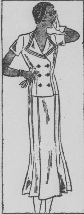
Suit of Pique

Why is it? Certainly not because it's new. You've seen pique ever since you wore it in the grade schools, though of course it's being used today in ways you'd never have