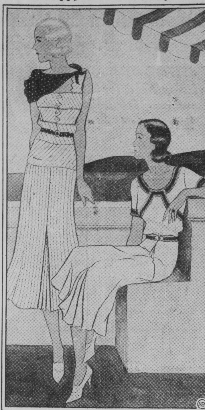
(Frocks from Birke and Birke, New York.) A Pair of Snappy Holiday Costumes