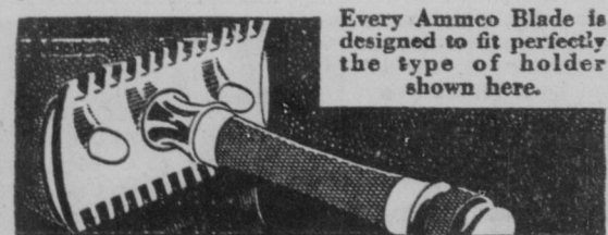
Every Ammco Blade is designed to fit perfectly the type of holder shown here.

AMMCO, 150 WEST 28th STREET, NEW YORK CITY