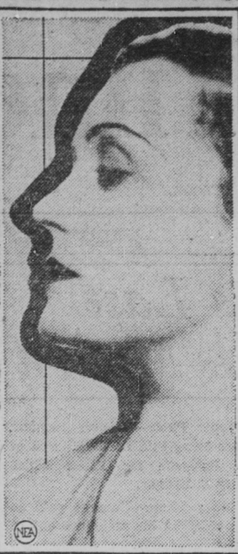
Pola Negri... benefited by her vacation.

She didn't spend all of her time over there vacationing, however. More than a year was spent making appearances on the legitimate stage. But she turned a very deaf ear to all offers to appear in European talkies.