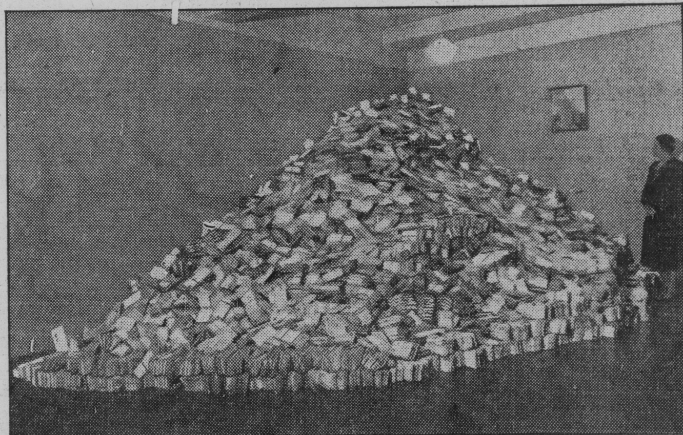
Entries in the Camel cigarette $50,000 prize contest were received so fast that it was more than a week after the close of the contest before all the mail could be opened. In this pile were more than 500,000 letters awaiting reading by the judges and their staff.

It is expected the judges in the $50,000 Camel Cigarette Prize Contest will be able to render their decision within a short time and that public announcement of the prize winners can be made soon.