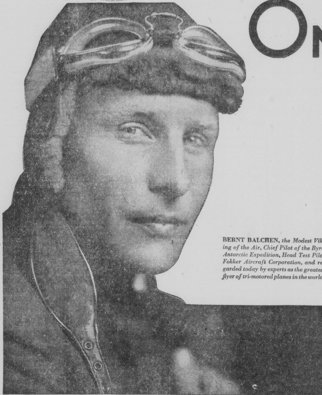
BERNT BALCHEN, the Modest Viking of the Air, Chief Pilot of the Byrd Antarctic Expedition, Head Test Pilot Fokker Aircraft Corporation, and regarded today by experts as the greatest flyer of tri-motored planes in the world.

DR. W. B. CALDWELL'S SYRUP PEPSIN A Doctor's Family Laxative