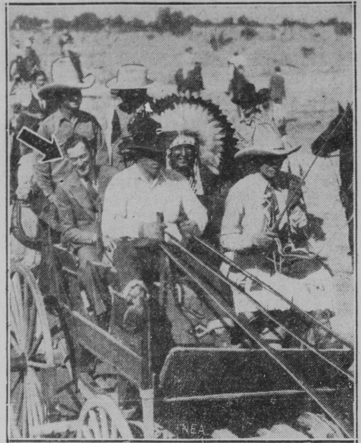
Mayor Jimmy Walker of New York City is shown here grinning gaily as Indians and cowboys welcomed him to Palm Springs, Cal., on his western vacation trip. Smart cracks dropped easily from the mayor's lips, though back in New York civic forces are gathering in an effort to have him ousted.

by the Indianapolis section of the International Workers Order in Communal hall, 17 West Morris street, Wednesday night.