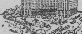
Your Hotel Address