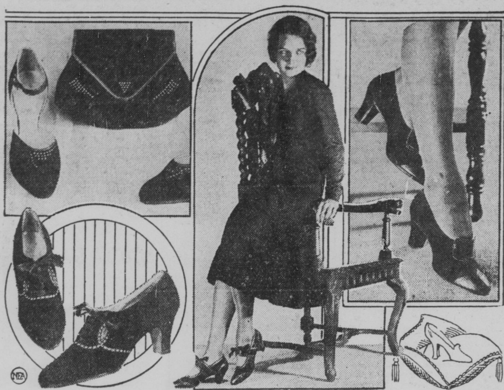
First-aids to those climbing the ladder of success are the new autumn shoes.

Left—Top, sleek and graceful is a dressmaker ensemble of strap sandals and the new pump envelop purse of a rich red suede, with kid pipings and pearl luster trim, in ruby tones; bottom, a blue buckskin oxford has blue and white kid braid