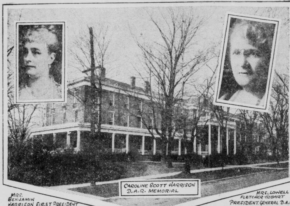
Mrs. Benjamin Harrison, first president-general of the National Society of the Daughters of the American Revolution.