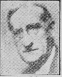
Sidney S. Lenz