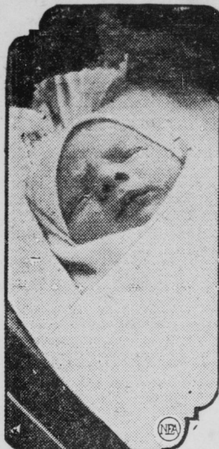
Here is England's most famous baby—even if he does seem to be turning up his nose at the distinction. The infant 'son of Lady Diana Cooper, Britain's "most beautiful woman," is shown above in his perambulator as he was taken out doors for his first airing. Lady Diana appeared as "The Madonna" in the New York production of "The Miracle."