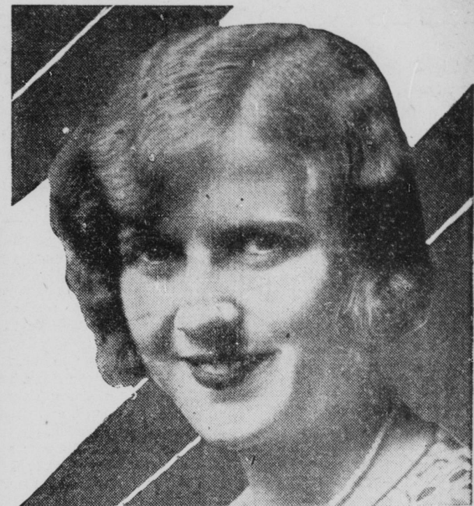
ENDED COLD NOVEL WAY

Many Here Surprised to Find How Quickly Head Colds, Coughs and Chest Colds Disappear When Treated By Methods Doctors Now Advise for Home Use.