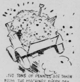
FIVE TONS OF PENNIES ARE TAKEN FROM THE MACHINES EVERY DAY