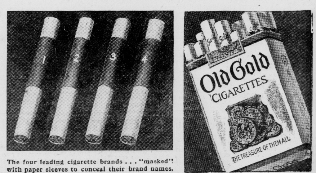
The four leading cigarette brands... "masked" with paper sleeves to conceal their brand names.

ON YOUR RADIO... OLD GOLD-PAUL WHITEMAN HOUR ... Paul Whiteman, King of Jazz, with his complete orchestra, broadcasts the OLD GOLD hour every Tuesday... from 9 to 10 P. M., Eastern Standard Time... over the entire national network of the Columbia Broadcasting System.