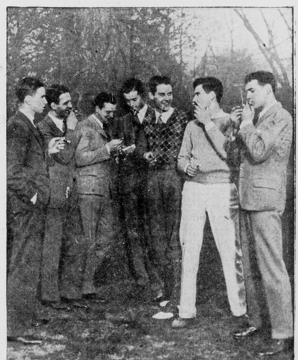
"WHICH ONE TASTES BEST?" Is the way the college newspaper put the test to one-third of the student body at this famous old New England college. The 4 leading cigarette brands were smoked with paper "masks" over the names, so that neither prejudice nor habit could influence the results.

As a result of the try-outs held last Friday