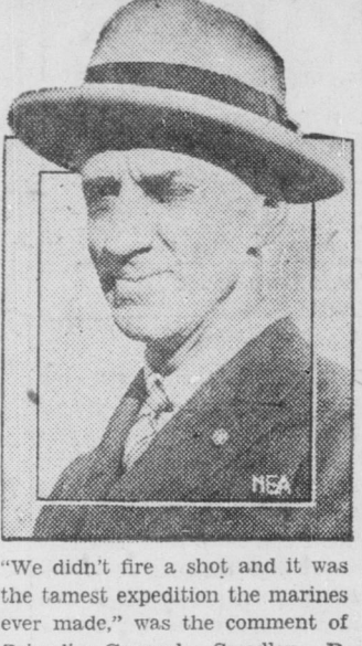
"We didn't fire a shot and it was the tamest expedition the marines ever made," was the comment of Brigadier-General Snedley D. Butler upon his return to San Francisco the other day. Butler and a brigade of marines went to China two years ago when Americans were said to be in danger.

pending wreck and leaped to safety. As the car drew nearer, with no apparent effort being made to slacken its speed, a wild scramble to leave the rear platform took place.