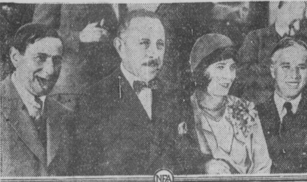
Among the British journalists visiting America in the interests of international peace, according to the plan of the Carnegie Foundation was Ralph D. Blumenfeld of the London Daily Express. Here he is shown in Hollywood, with Wilma Banky and Charles Chaplin on his right, and Ernest Lubitsch, producer, at his left.

and I got to thinking about what would happen to that ship if it got into the same kind of a blow.