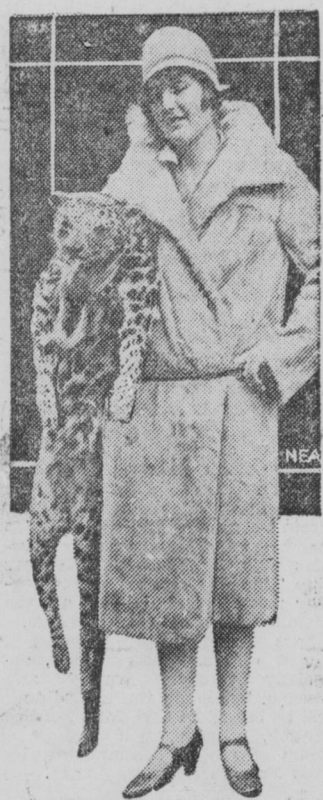
The latest decree of fashion, if you're interested in that sort of thing, is the possession of a cheetah, to go about with you everywhere. It should be added that this is made quite safe and sane by the fact that the cheetah is well stuffed and quite lifeless.