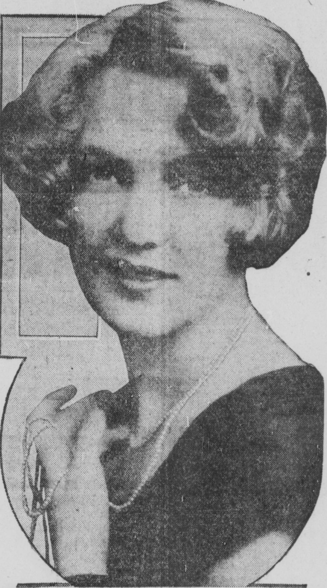
Virginia Cherrill, 20-year-old Chicago society girl, has embarked on a new role. She will play leading lady for Charles Chaplin in the comedian's new film, "City Lights," and looks as though she would brighten up the picture considerably.

weather already had set in over the Atlantic and he wished to avoid as much of it as possible.