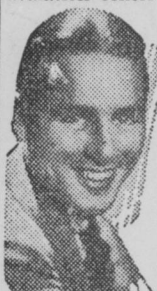
Ben Lyon planes while he was making "Hell's Angels."

Canada's imports from the United States in June were valued at $75,472,000.