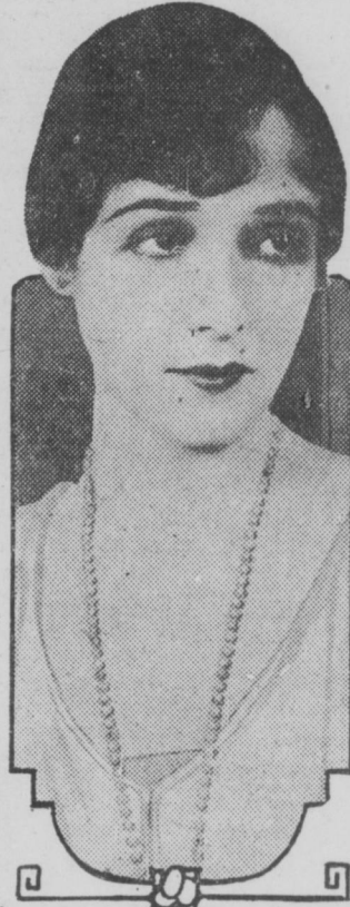
Florence Vidor Heifetz

The exodus for home was due to begin before night. Secretary Kellogg will be taken to Dublin aboard the cruiser Detroit with William T. Cosgrave, president of the Irish Free State, to repay Cosgrave's recent visit to the United States.