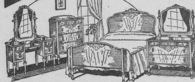
A Small Deposit Delivers This Suite to Your Home

Extra! EXTRA! All Floor Lamps All Bridge Lamps All Table Lamps Go at 25% Off Regular Prices