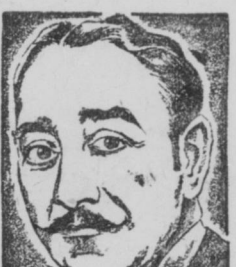
ADOLPHE MENJOU in "His Private Life" and two more sparkling productions, typically Menjou.