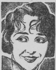
BEBE DANIELS the comedienne with "it," in four zippy comedies, the first "Take Me Home."