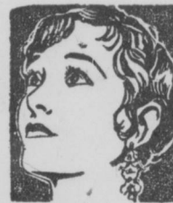
FLORENCE VIDOR The aristocrat of the screen stars in two productions, the first "Divorce Bound."