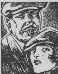
"BEGGARS OF LIFE" with music score and sound effects. Wallace Beery also in "The Tong War."