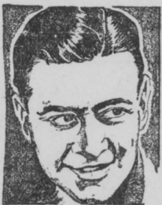
RICHARD DIX in "Warming Up", comedy-drama of Big League Baseball. With music score and sound effects. 4 more.