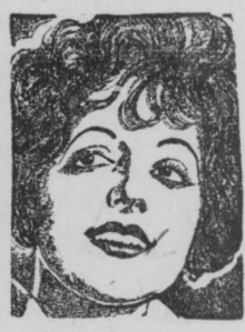
CLARA BOW will be in four big specials, the first "The Fleet's In", with James Hall, one by Eliaor Glyn and two more.