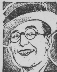
HAROLD LLOYD will have another of his inimitable comedies (Produced by Harold Lloyd Corp.—Paramount Release).

¶ Now—a great new world of entertainment is opened to you! Paramount Pictures with synchronized music score, sound effects and talking sequences! What you see you hear—the roar of a crowd, the drone of a plane, the voices of your favorite stars! Paramount Features, Paramount News, Christie Comedies, Stage Presentations—the "Whole Show" in Sound by Paramount—the one name that means quality in entertainment! ¶ Not all theatres are now equipped to show "sound" pictures but wherever they are, you can hear as well as see from 40 to 50 of the 70 feature pictures in Paramount's Whole Show Program for 1928-29. ¶ Plan to enjoy it all. Assure yourself of this great entertainment that makes life so much bigger, broader, richer for you. See that the theatre you now attend shows these Paramount Pictures, either silent or with sound, or patronize one that does!