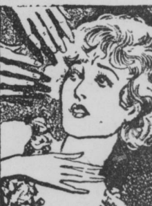
ESTHER RALSTON in one special "The Case of Lena Smith" and four sparkling starring productions.