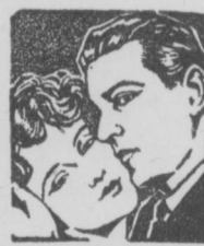
FAY WRAY and GARY COOPER "Paramount's Glorious Young Lovers" in "The First Kiss" and three more productions.