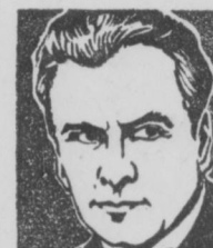
THOMAS MEIGHAN In "The Mating Call" with Evelyn Brent & Renee Adoree. Produced by Caddo Co.