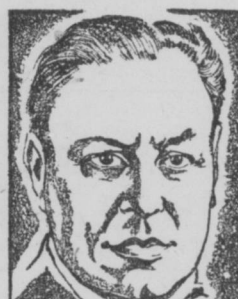
EMIL JANNINGS In an Ernst Lubitsch production "The Patriot," with synchronized music score and sound effects. 2 more.