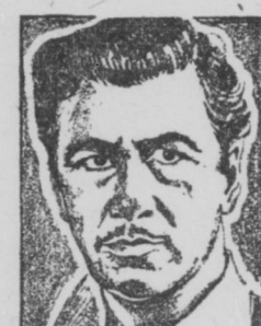
GEORGE BANCROFT in "Docks of New York," synchronized music score and sound effects. 3 more.