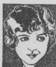
NANCY CARROLL Paramount's new personality girl, featuring in "Abie's Irish Rose" "Water Hole" & more.