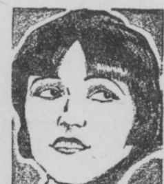
POLA NEGRI "Loves of an Actress," with synchronized music score and sound effects. 1 more.